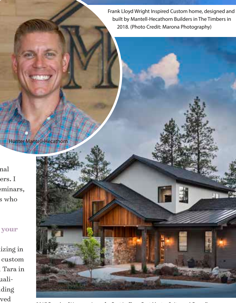
2017 Parade of Homes winner for Best in Class, Best Master Suite, and Overall Sustainability. Transitional custom home designed and built by Mantell-Hecathorn Builders in The Timbers in 2016.